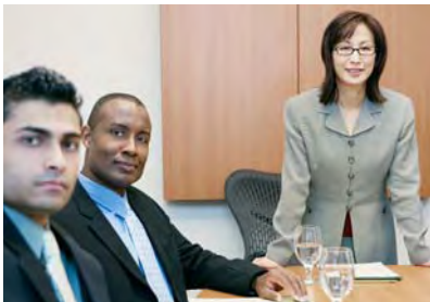
FARGO SECURE INTEGRATORS

DON'T THINK YOU HAVE TO DO THIS ALONE. FARGO HAS EXPERTS ALL OVER THE WORLD.