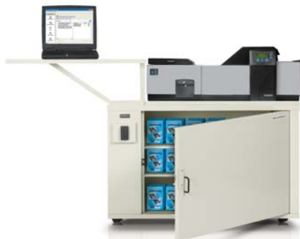
Security plus convenience. SecureVault 2000 with Workstation provides an efficient work surface for PC and other system components.

SecureVault helps prevent inefficient work stoppages by alerting operators whenever materials in inventory drop below a preset level.