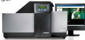
Non-laminating HDP600 shown with Fargo Print Security Manager