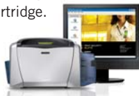
Single-sided DTC400 shown with Print Security Suite