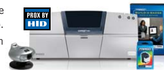
CardJet 410 Photo ID System shown