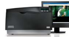
Non-laminating DTC550 shown with Fargo Print Security Manager